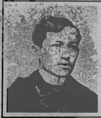
DR. JOSE P. RIZAL (1861-1896) National Hero of the Philippines

JOSE RIZAL, Filipino patriot, martyr, and genius, occupies an eminent place in the Valhalla of Philippine Immortals. Acclaimed as one of Asia's great freedom fighters, his memory is revered by his countrymen and he is oftentimes referred to as "The Great Malayan."